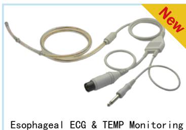
Esophageal ECG & TEMP Monitoring