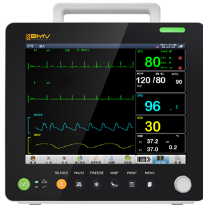
Vital signs show perfectly