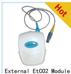
External EtCO2 Module